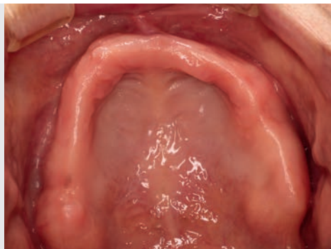
Fig. 2: Edentulous upper jaw with a flabby ridge in the anterior region and advanced bone resorption