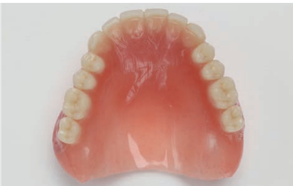
Fig. 11: Completed maxillary denture

The denture wax-ups were flaked and sprued (Fig. 8). Once the moulds were created and the wax was boiled out, the flasks and teeth were prepared for the injection moulding process. The predosed denture base material was mixed and the capsules containing the mixed material and the flask were mounted on the injection device (IvoBase Injector). Once an appropriate program was selected, the injection process