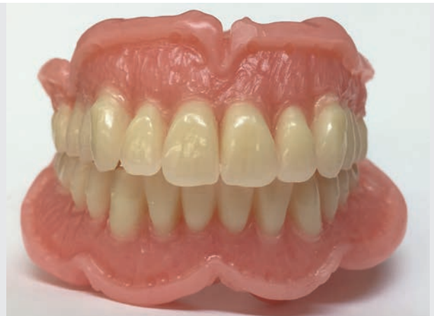
Fig. 9: Dentures prior to soft tissue customization