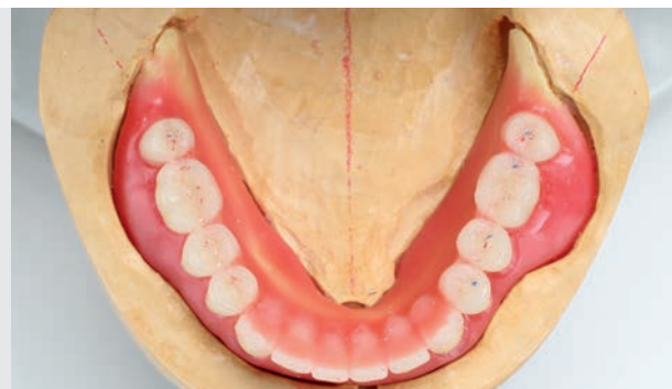
Fig. 7: Setting up the mandible: premolars are also used in the dorsal area.