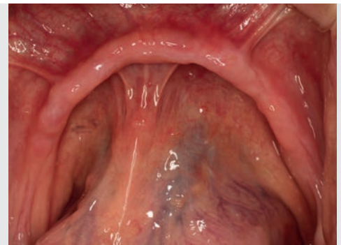
Fig. 3: Asymmetrical alveolar ridge progression in the mandibular arch