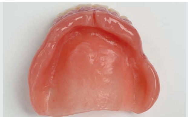
Fig. 12: View from the reverse side: the broad functional margin in the labial vestibule prevents the denture from shifting.