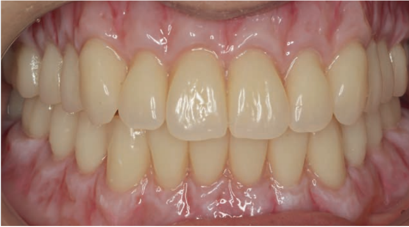
Fig. 13: Customized denture in situ: It's hardly noticeable that the patient is wearing conventional full dentures.