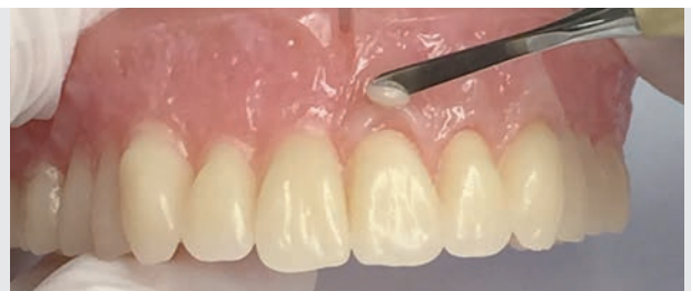
Fig. 10: The interplay of different shades of lab composite (SR Nexco) results in a three-dimensional depth effect. Morphological aspects are also considered in the customization of the soft tissues.

given to faithfully mimicking the natural oral soft tissues, as we wanted to provide a maximum level of esthetics already at the try-in stage. Five different shades of wax were used for characterization. By creating vestibular gingival portions that have a delicate yet effective appearance, the customized look can be accentuated. Esthetics, phonetics, occlusal vertical dimension and centric relation were assessed at the try-in of the wax-up and rated as good.