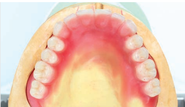
Fig. 6: Setting up the maxilla: the premolars are positioned closely to the alveolar crest.

Designed for classic occlusal schemes, the SR Phonares® II moulds are ideally suited for complete dentures. The facial meter (alameter) integrated into the SR Phonares II FormSelector assisted in selecting the moulds that were best suited for our patient. The teeth were set up in line with the set-up criteria for the classic occlusion. To prevent the flabby ridge from allowing the denture to move, the upper premolars were positioned close to the centre of the alveolar ridge (Fig. 6). We decided to place premolars in the dorsal area of the mandibular arch to achieve an external seal with the buccal mucous membrane and the lingual wall at closed mouth position (Fig. 7). The requirements of function and stability and patient specific characteristics were considered in the tooth set-up. The patient was in the habit of chewing food with her anterior teeth because of her Angle Class III malocclusion. This should be avoided in the new dentures by providing enough freeway space between the anterior upper and lower teeth at the set-up. A great deal of attention was