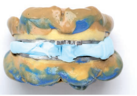
Fig. 5: Customized impression tray and registration device form a unit.

The area of the flabby ridge was marked on the model and covered with a spacer to ease the pressure. Subsequently, customized trays were fabricated. To prevent the denture to shift upwards and forwards, a wide labial rim was created in the upper anterior vestibule. Dorsally, the tray ended at the vibrating line. The custom tray should also provide a suction effect in the mandibular jaw. Relatively voluminous margins were created to achieve this. Sufficient tongue space was provided and the anterior area was given a slightly concave contour.