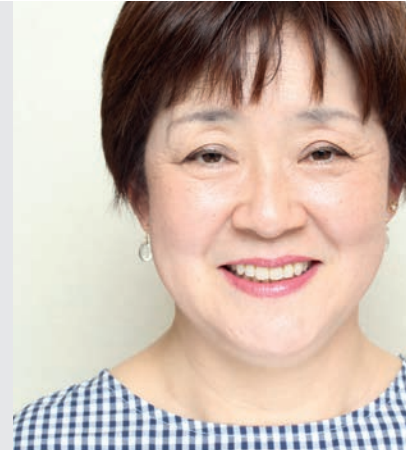
Fig. 14: Compared with the initial situation, the patient looks clearly younger and happier.

started. The result after divesting matched the requirements. Even fine details of the wax-up were exactly reproduced (Fig. 9). The dentures fitted the models accurately and required only minimal reworking.